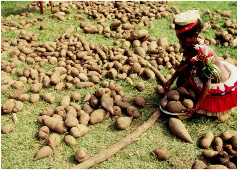
Yams are gathered during the Yam festival in Papua New Guinea.