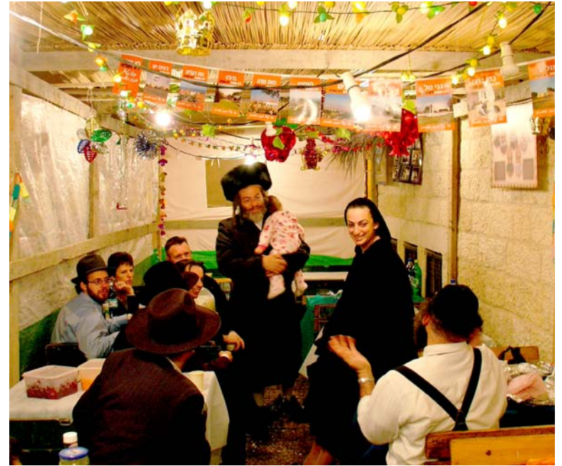
Enjoying a Sukkoth meal in a hut

In the United States, people celebrate the harvest in November. This celebration is called Thanksgiving .