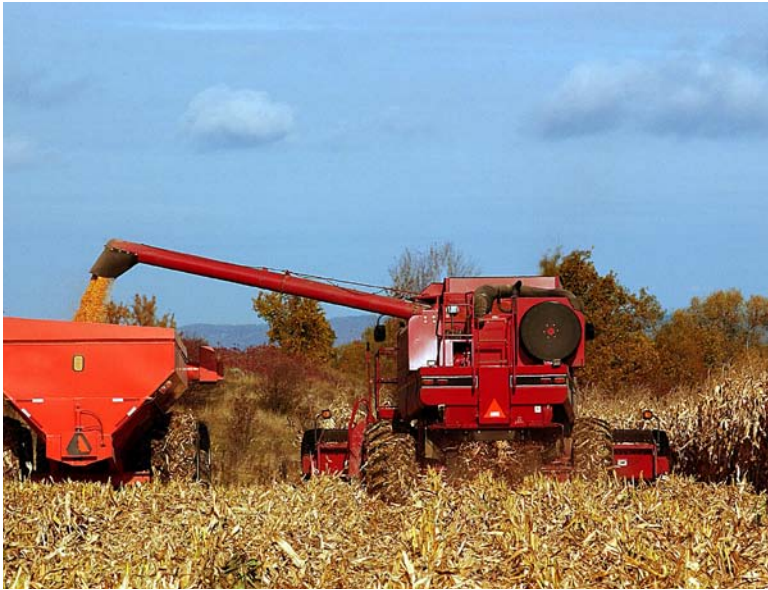
A farmer gathers his corn crop.