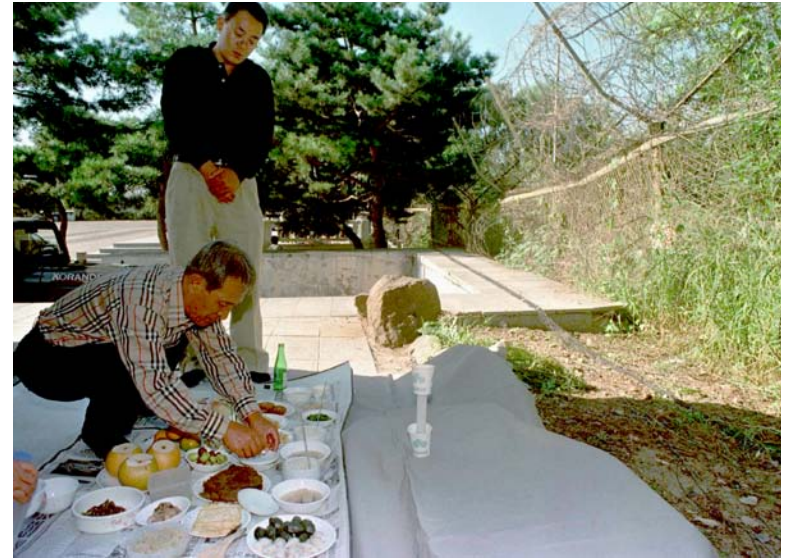
A family celebrates with a meal at the grave of an ancestor.