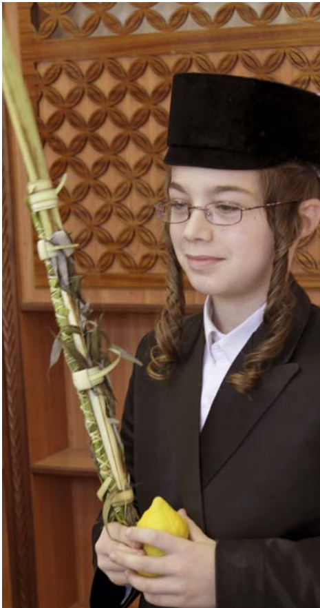
A boy carries a lulav and etrog.

There are seven days of feasting and religious services. Abel and