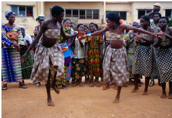
At the harvest in West Africa, people dance to celebrate the yam crop.

After the ceremonies, yams are divided among the villagers. Everyone cooks dishes made with yams and other vegetables. The festival lasts many days in Bem and Sade's village.