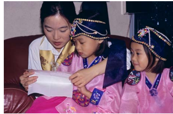
A mother sits with her daughters, who wear traditional costumes.