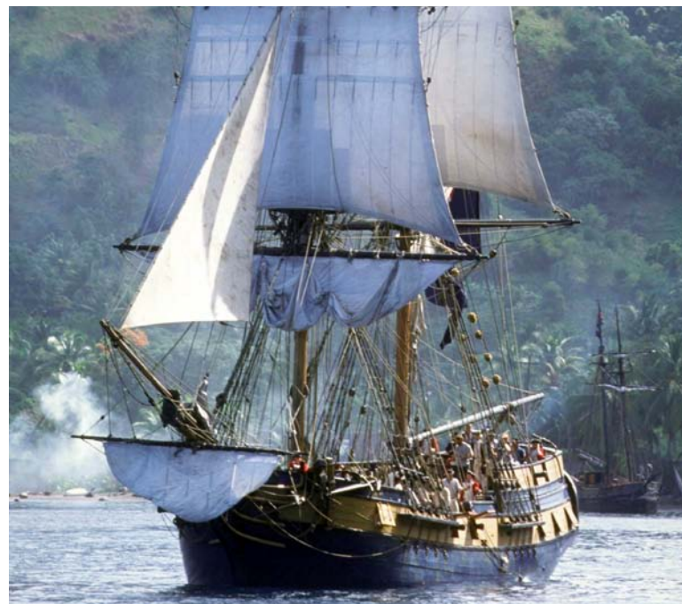
One of the pirate ships recreated for the Disney movie Pirates of the Caribbean: Curse of the Black Pearl .

Blackbeard fought bravely but Maynard had too many men. Blackbeard was shot five times before he finally fell dead. Maynard's men threw Blackbeard's body into the sea.