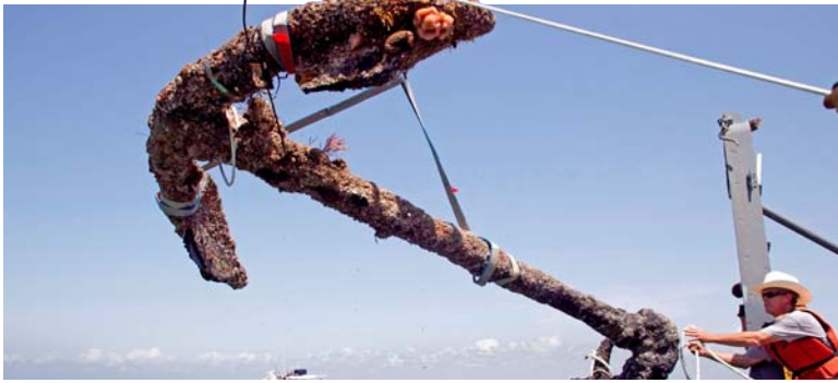
The wreck of the Queen Anne's Revenge was found near the Beaufort Inlet, off the coast of North Carolina, in 1996.