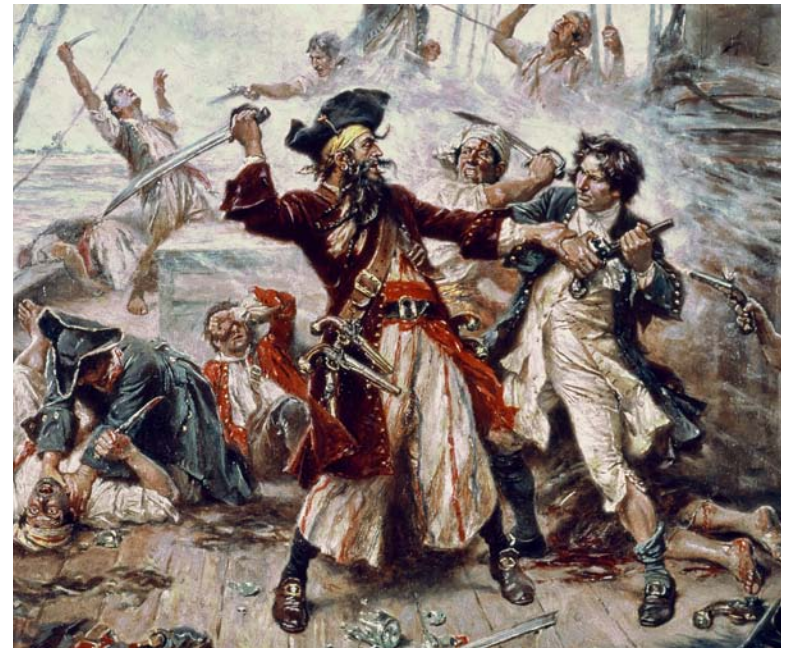
Blackbeard's last battle at Ocracoke became famous. Even young Benjamin Franklin wrote a poem about it.