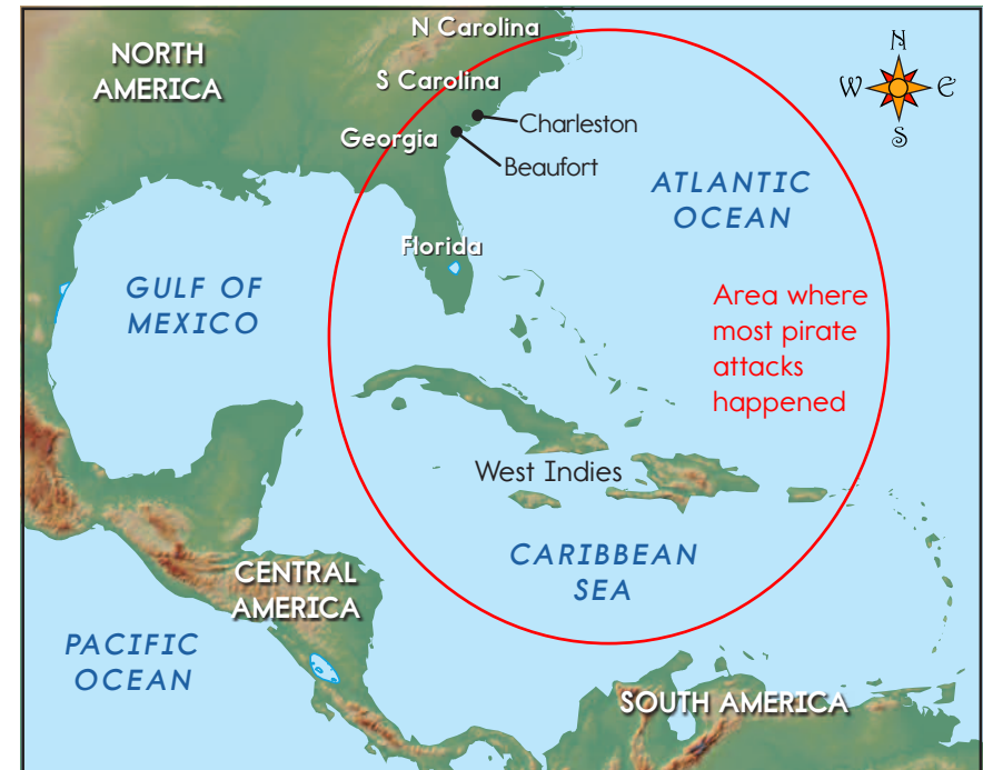
The trading ships of many countries sailed back and forth across the southern Atlantic Ocean. It was a very busy area for trade—and for piracy.

Not many facts are known about the man who was called Blackbeard. He may have been born in Bristol, England, around 1680. His real name was Edward Teach. Sometimes his name was spelled Thatch or Teache .