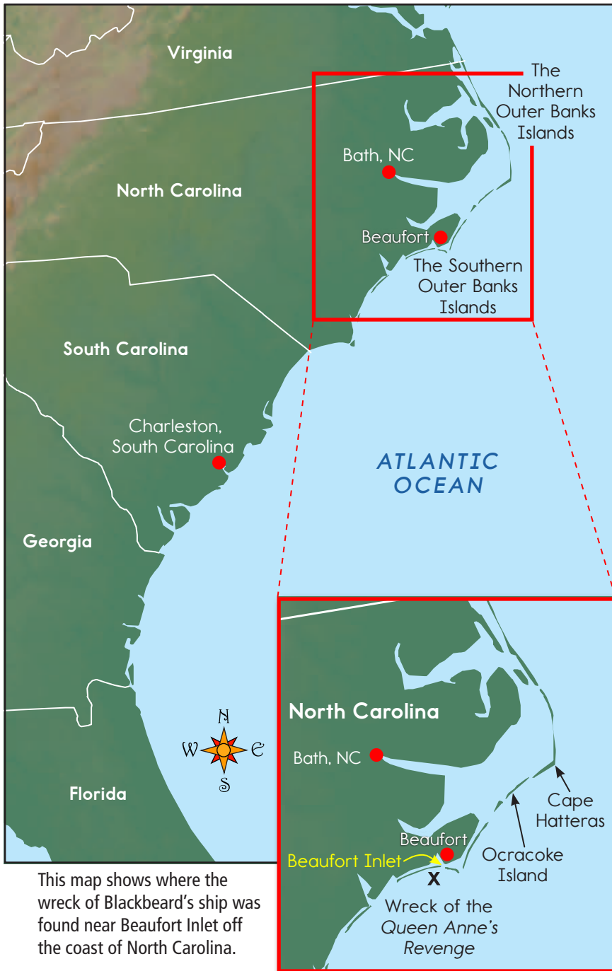
This map shows where the wreck of Blackbeard's ship was found near Beaufort Inlet off the coast of North Carolina.

Edward was fearless and bold. Captain Hornigold put him in charge of a captured ship. The two worked as a team, attacking ships and stealing cargo . Soon, they were the most feared pirates on the ocean.