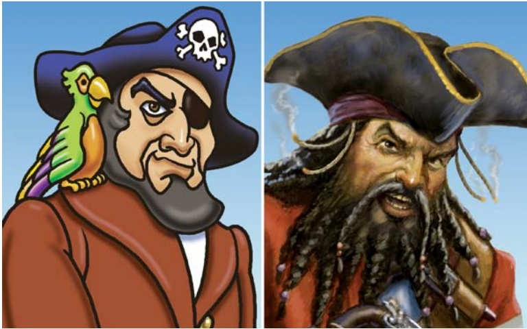
Movie and cartoon pirates may look funny, but real pirates like Blackbeard (right) were colorful characters, too.